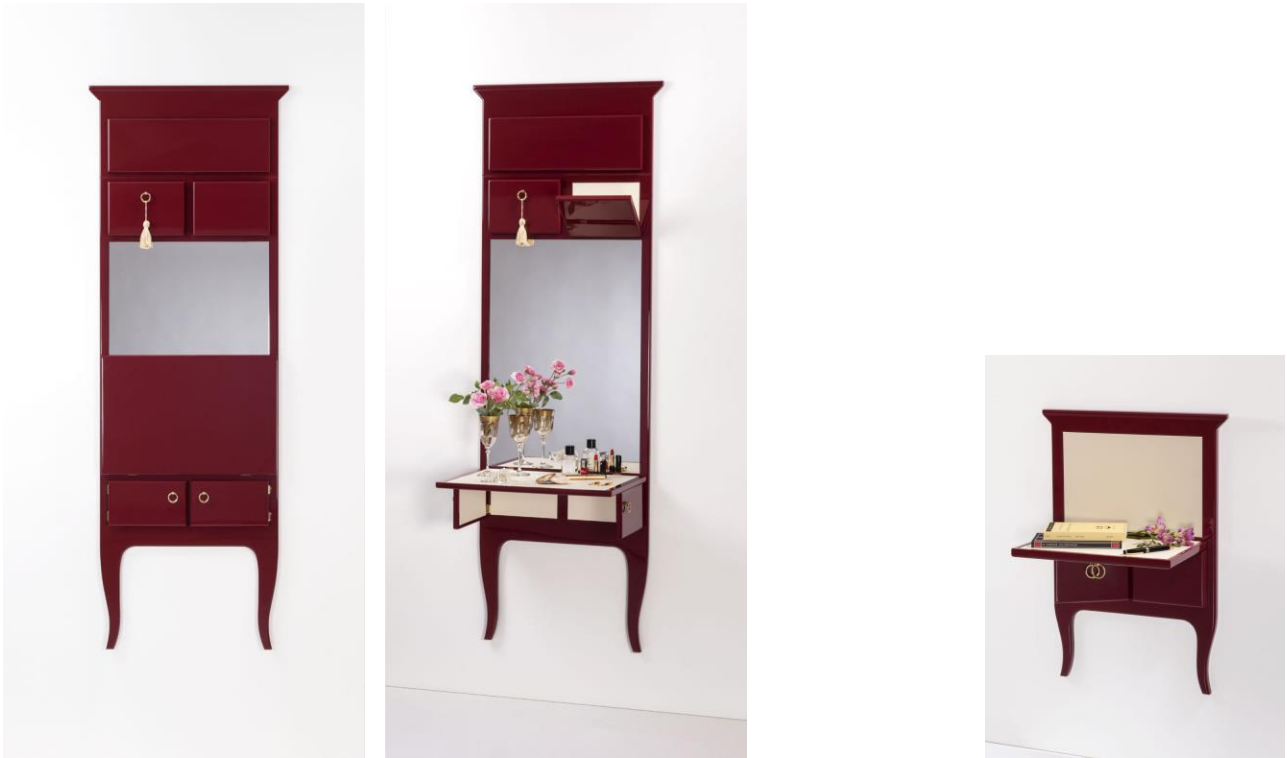
False Credenze - design HABITS Studio, 2015

The new version of False Credenze , in desk, bedside tables and consolle models (both flat and wall-mounted) optimise space in any room in the home or corner in which they are placed. Shelves and tops meet both aesthetic and functional needs, offering additional space where needed.